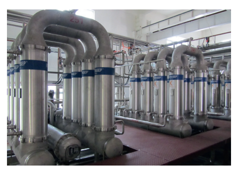
Filtration unit for antibiotics production