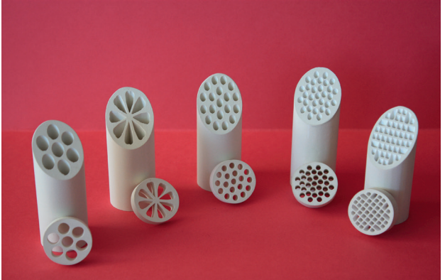
The Kerasep® membrane range

The well-known Kerasep<sup>®</sup> module completes Novasep's CFF solution for the industry. Extremely robust, the Kerasep<sup>®</sup> module is designed to provide the user with high-performance, easy cleanability and maintenance.