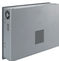
▲ Back view