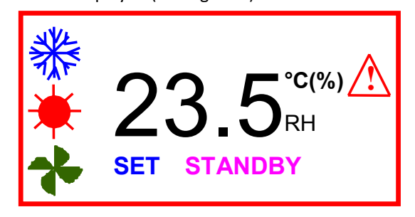
Figure 2; LCD Layout

The RED led on the front of the display indicates the alarm status: if the led is blinking the unit is in "warning condition", if the led is fixed lighted the unit is in "alarm condition". On the LCD the following symbols will be displayed (see Figure 2):