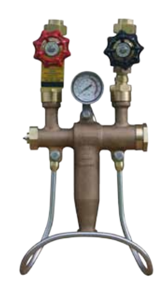
Shown: Bronze M-5000TG Low flow

Our Temperature Indicating ( TG ) model ( M-5000TG Low Flow ) is equipped with a dial-type gauge that accurately indicates the wash water's temperature. It also feature a specially designed integral blending chamber to thoroughly blend steam and cold water.