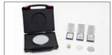
Calibration foil sets and reference blocks