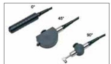
Positioning aid for micro probes