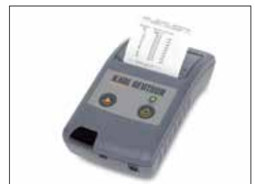
Mobile thermal printer