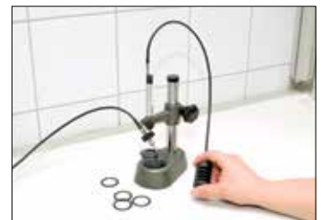
Probe positioning device