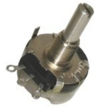
Representative photograph, actual product appearance may vary.

Due to regional agency approval requirements, some products may not be available in your area. Please contact your regional Honeywell office regarding your product of choice.