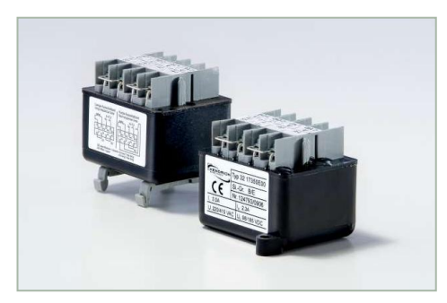
32 17350Exx 32 17353Exx BINDER-\mu ikroPower^{\circledR}